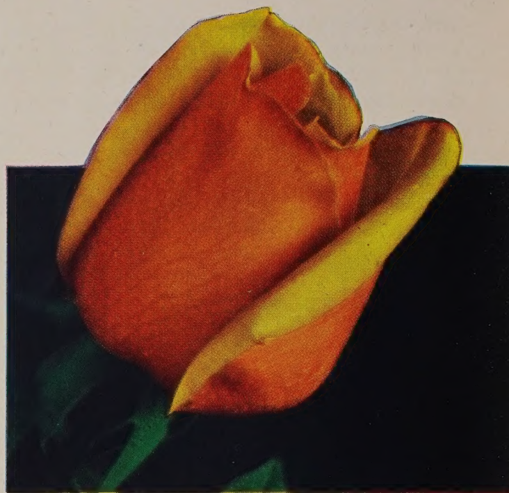
CALIFORNIA—$1.50 each; 3 for $3.75 (Plant Patent 449)

MME. CHIANG KAI-SHEK —Patent applied for. All-America winner for 1943. The color is lemon-yellow fading to light yellow as the flower matures. A splendid tribute to a great lady. Bud and flower unusually large, foliage glossy, growth compact. $2.00 each, 3 for $5.00.